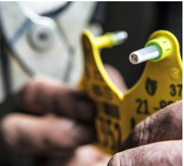
Genomic registration for the suckler herd is a "small jump", says Teagasc.

A Teagasc beef seminar in Wexford included lengthy discussion on the commercial beef value (CBV) index for cattle.