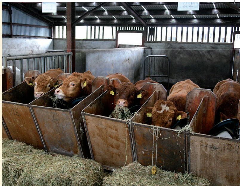
GENE IRELAND progeny on performance test in the Tully Test Centre, Co. Kildare.